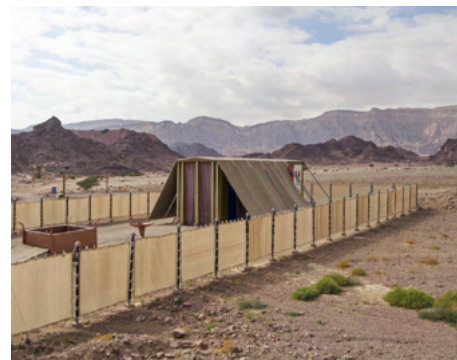
Images of Tabernacle